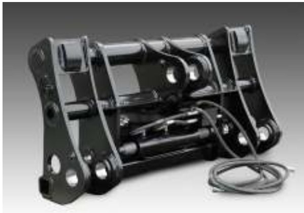
Class 2, 3, 5, & 6 CF Loader Coupler